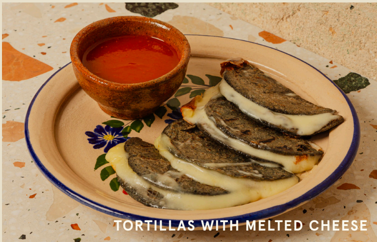
TORTILLAS WITH MELTED CHEESE